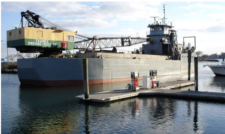
November 29, 2008. Gwenmor Marine's 110' dredging barge approaches HYC lagoon to begin the long anticipated dredging operation.